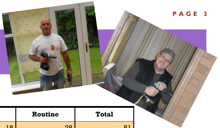
Number of repairs reported/identified