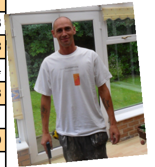
Percentage of repairs responded to within target time